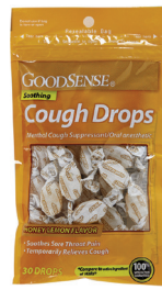
Cough Drops, Honey Lemon Count: 30