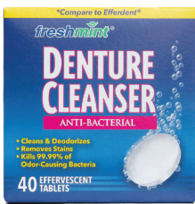
Denture Cleaning Tablets Count: 40