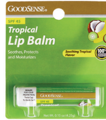
Medicated Lip Balm, 0.15 oz. Count: 1