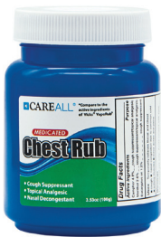
Vapor Rub, 3.5 oz. Count: 1