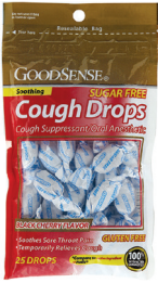
Cough Drops, Sugar-Free Count: 25