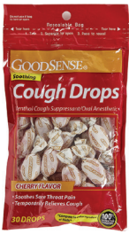
Cough Drops, Cherry Count: 30