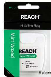
Dental Floss, Reach® Mint Waxed Count: 1