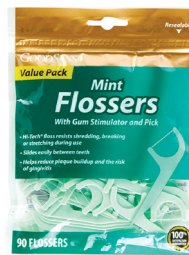
Interdental Flossers Count: 90